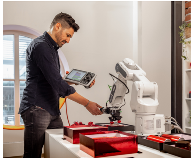
Working range, CRB 1100-4/0.475