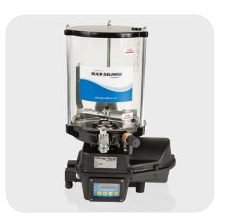
MultiPort II Lubricator

The MultiPort II Lubricator is an electrically driven multiple outlet lubrication unit designed primarily for use with progressive divider valve systems to accurately control the amount of grease and to monitor system performance via an integral controller.